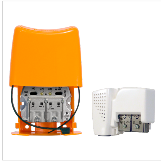
Televes reserves the right to modify the product